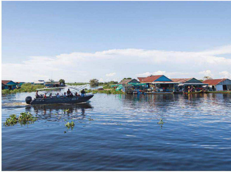
Adventure: day trips to the mainland; opposite, the Aqua Mekong

It's a member of Small Luxury Hotels of the World and the rooms come with Smeg kettles, Dyson hairdryers, Bluetooth speakers and Codage Paris bath products. It's tranquil, thoughtful, luxurious – as soothing as being in a day spa. When was the last time anyone expected such a thing in bustling Hong Kong?